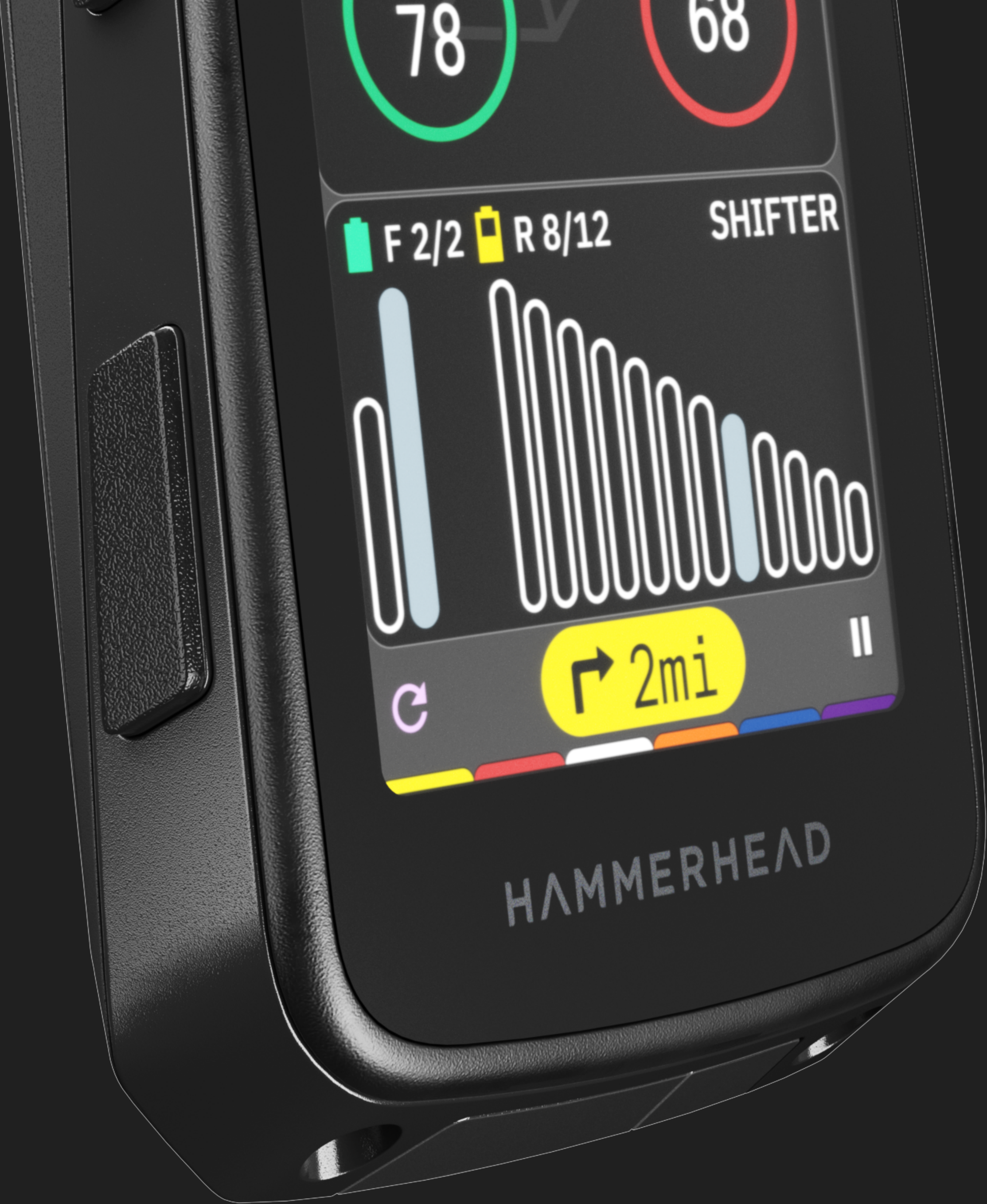
The brightness of the screen should always be shown at the maximum setting to ensure that quality of the screen is emphasized.